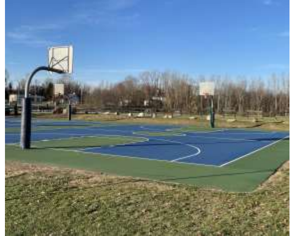
Resurfaced basketball court at Boyce Park