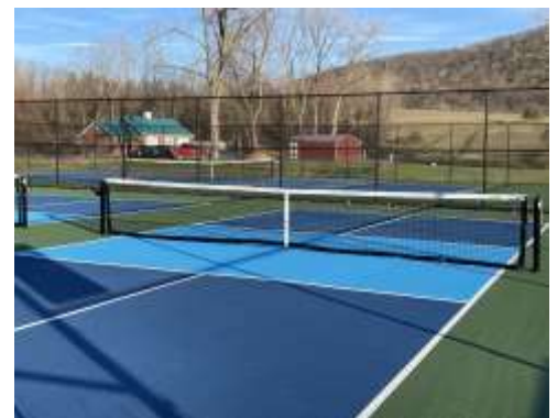
Resurfaced tennis court at Boyce Park

Lastly, the Town allocated ARPA Phase 2 funds to purchase a new gazebo at Boyce Park to replace the former one that was in dire need of replacement after twenty years of service.