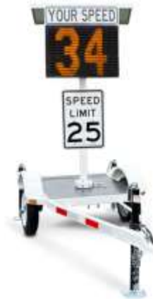
Photo of LED-powered Radar Feedback Device and Trailer

To address concerns about speeding on town roads, the Town utilized ARPA funds to purchase an LED-powered radar feedback device and trailer with Cloud-based software to monitor and download data from the device on demand. Starting in 2023, the device will be deployed as a first step to help town officials collect data and share with County and State law enforcement agencies to help improve overall public safety.