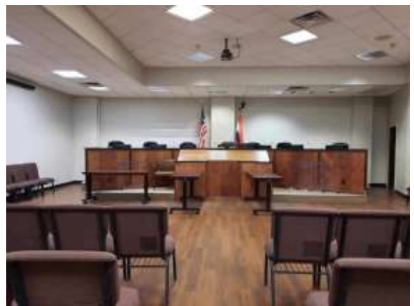
View facing Board Bench at Dover Town Hall