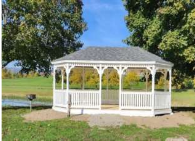
New gazebo at Boyce Park