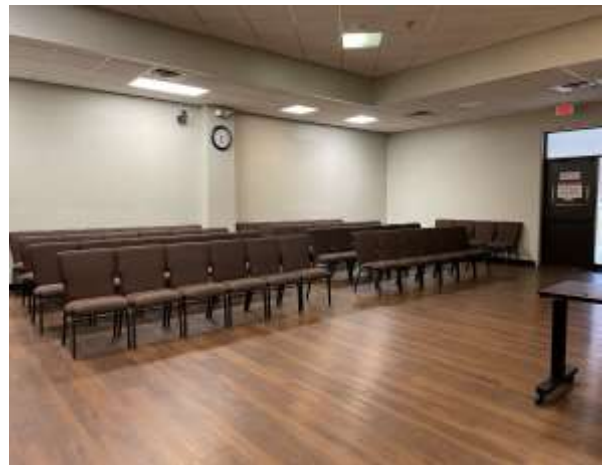
New painting and flooring at Dover Town Hall

Phase 2 funds will also be utilized for painting and new flooring for the offices of the Town Supervisor, Planning, Finance, Records Management and Building Department at Town Hall.